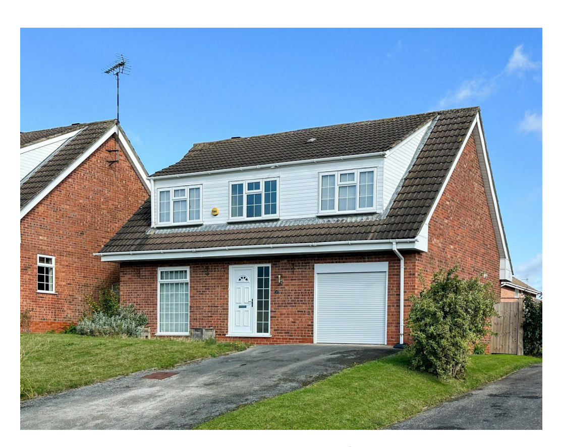
*** Sold with no onward chain*** This detached family home is immaculately presented throughout. The accommodation comprises entrance hall, downstairs W.C., lounge dining room, kitchen, utility room, ensuite, four bedrooms and a bathroom. The property further benefits from a drive, garage and an enclosed rear garden.