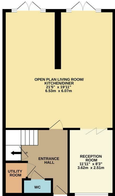
GROUND FLOOR 651 sq.ft. (60.5 sq.m.) approx.