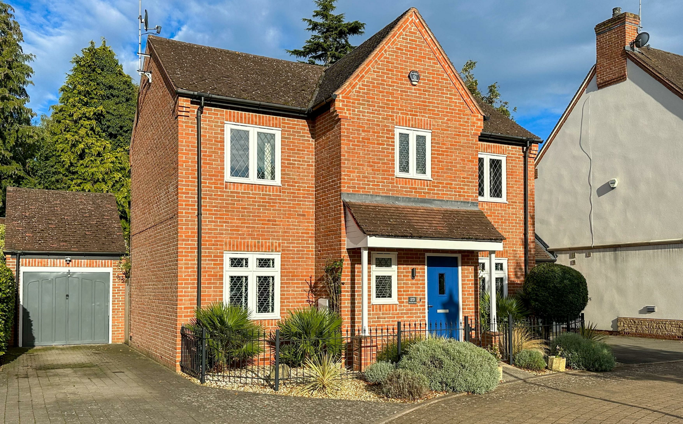
23 Elgin Gardens, Stratford-Upon-Avon, CV37 7BG Guide Price £695,000