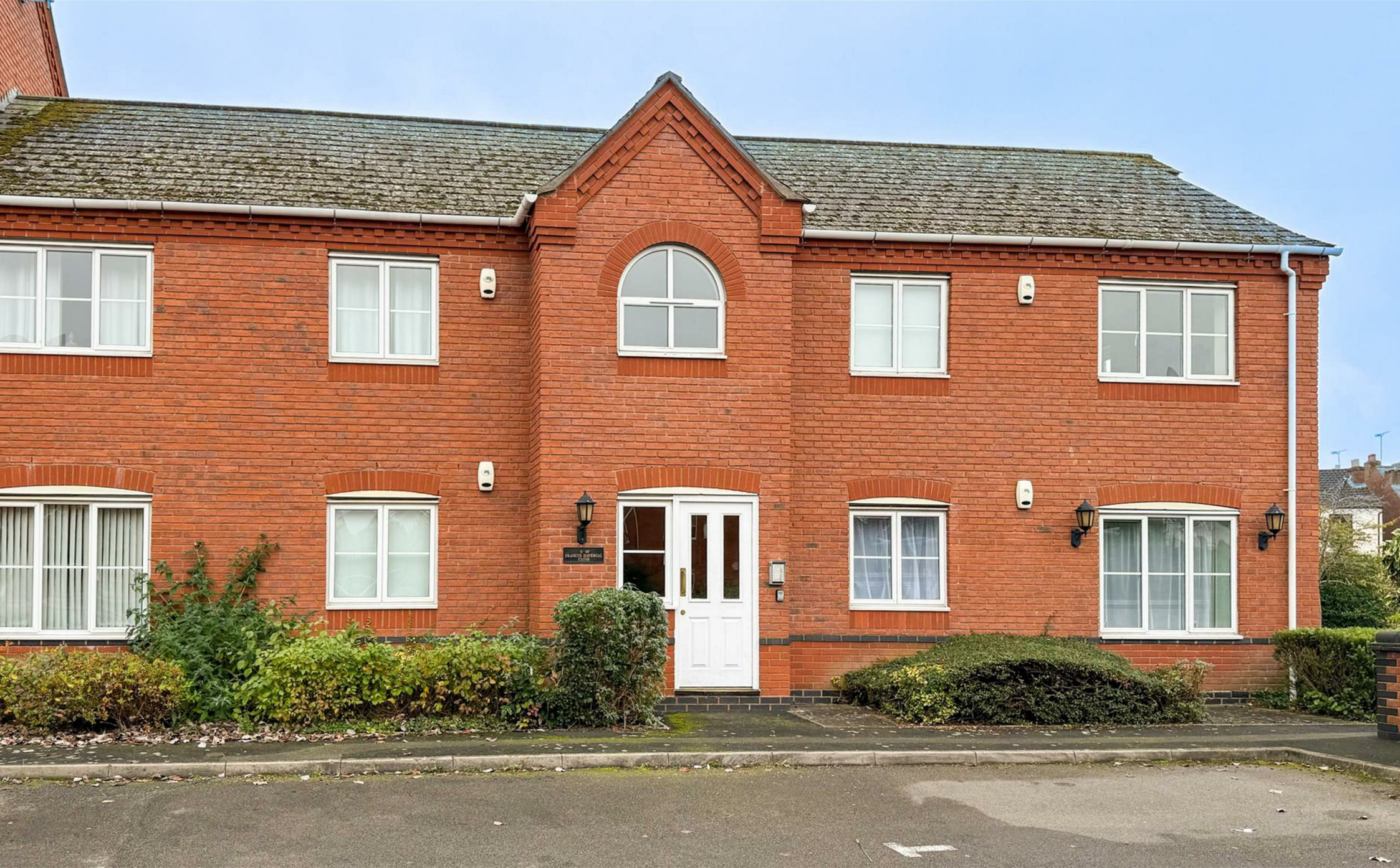
7 Frances Havergal Close, Leamington Spa, CV31 3BU Guide Price £165,000